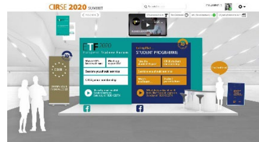
CIRSE 2020-2021 online