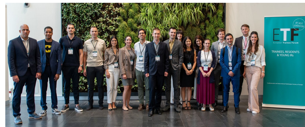
IRs in training